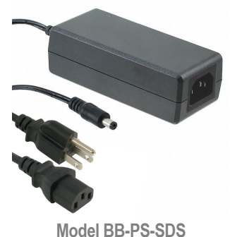
Includes NA/USA Power Cord