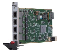
MIC-3860-A1S1 MIC-3860-C1S1 (with PoE LEDs)