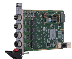
MIC-3860-B1S1 MIC-3860-D1S1 (with PoE LEDs)