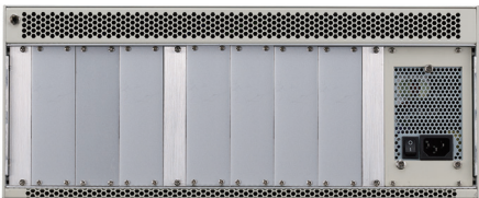
ATX PSU Rear side