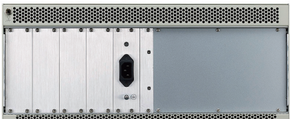
CPCI PSU Rear side