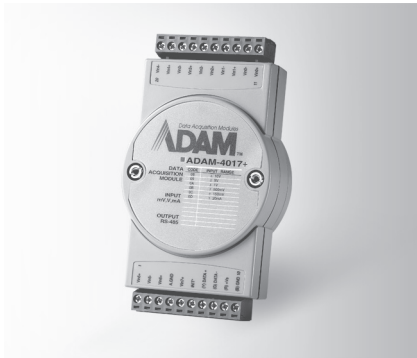
ADAM-4017+ FCC CE RoHS LISTED E190891 ETC.

8-ch Universal Analog Input Module with Modbus