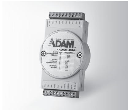
ADAM-4018+ FCC CE RoHS LISTED E190891 ETC.