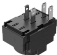
61-8102.02 Diode element

Terminal: Plug-in terminal, 2.8 x 0.5 mm