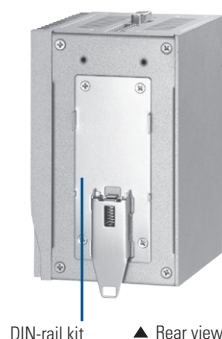
DIN-rail kit ▲ Rear view