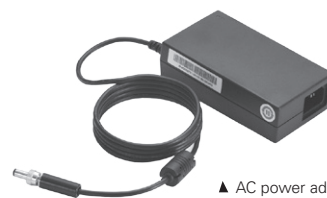
▲ AC power adapter (for GOT5840T-834-J)