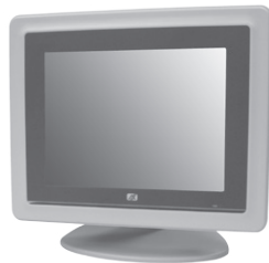
▲ Desktop stand