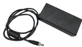
▲ AC power adapter (for GOT110--316-J)