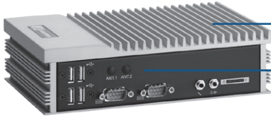
Intel® Atom™ processor D2550/N2600 Internal Mini Card and dual antenna

Fanless Embedded System with Intel® Atom™ Processor N2600 1.6 GHz or D2550 1.86 GHz, VGA and DisplayPort, 2 GbE LAN, 6 USB and 4 COM