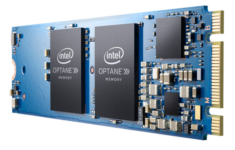
Intel® Optane™ memory module

Intel® Optane™ memory accelerates your system— delivering amazing speed and responsiveness without compromising system storage capacity. Together, Intel® Optane™ memory and a 7th Gen Intel® Core® processor give you a snappy computer experience with short boot times, fast application launches, extraordinary gaming and responsive browsing. Combine a large storage device with Intel® Optane™ memory for a responsive computer that keeps up with your most demanding applications.