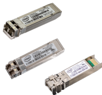
Intel Ethernet SFP28 Optics (SR, and SR and LR extended temp)

Intel Ethernet Optics and Active Optic Cables (AOCs) support multiple configurations and are fully compatible with the Intel Ethernet Network Adapter E810-XXVDA2.