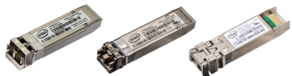
Intel® Ethernet SFP28 Optics (SR, and SR and LR extended temp)