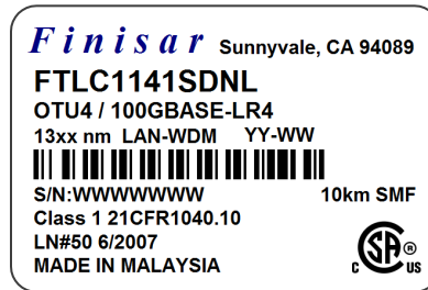
Figure 2. Standard Product Label