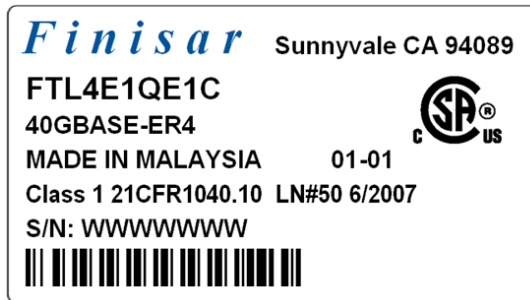
Figure 3 – FTL4E1QE1C production label