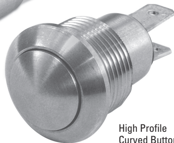
High Profile Curved Button