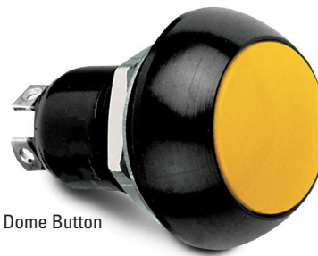
Flush Dome Button