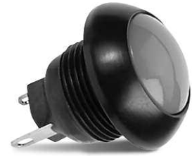
Flush Dome Button