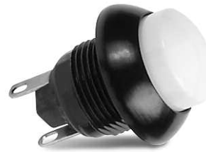
Raised Dome Button