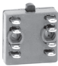
Front Terminal Style

Two switches in one case! The B5-7 series basic switches are miniature in size but feature up to 10 amps switching capability of 100,000 cycles.