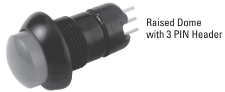
Raised Dome with 3 PIN Header