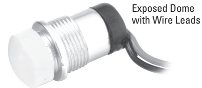
Exposed Dome with Wire Leads