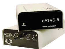
eATVS-8™ 8-Channel Automatic Temperature & Velocity Scanner