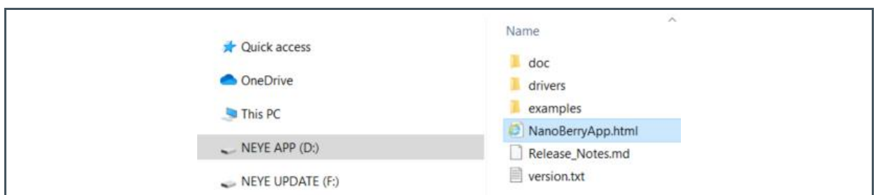
Figure 3: Drives Mounted on PC

Further help and instructions are in the Release_Notes file.md. (it can be opened in any text editor).