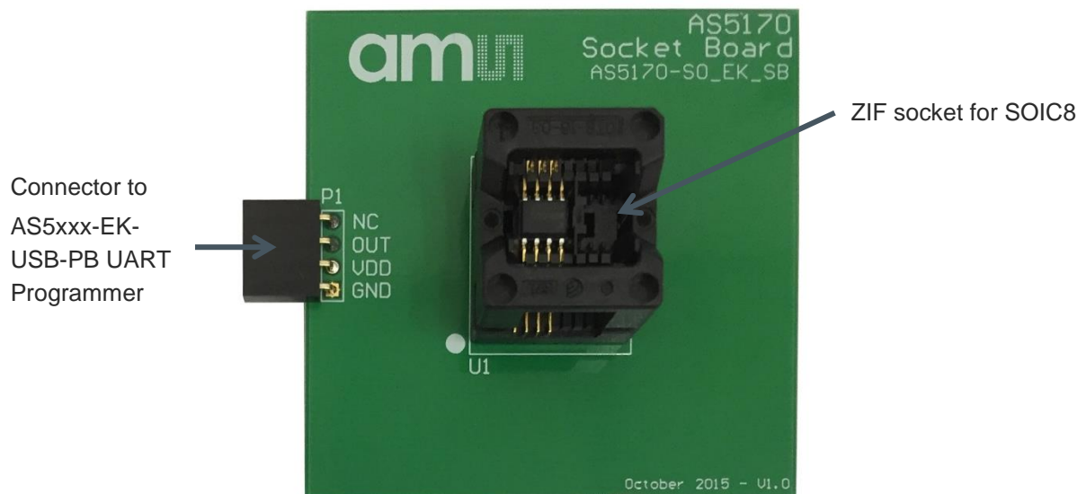
Figure 2: AS5170 socket board

All passive components needed for proper operation are included on bottom side the PCB.