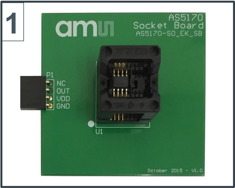
Figure 1: Kit content

The AS5170-SO_EK_SB socket board is used for quick programming of the AS5170A and AS5170B magnetic rotary position sensors without soldering due to its ZIF socket. This board can be used in combination with the AS5xxx-EK-USB-PB UART Programming Board and the provided LabVIEW evaluation software.