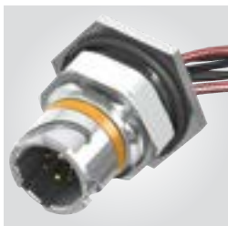
ACR-12 End 1 Mates: ACP-12 ACPK-12 End 2 Mates: IPL1

View complete specifications at: samtec.com?ACP-12