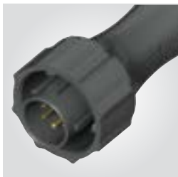
ACP-12 End 1/2 Mates: ACP-12 ACRK-12