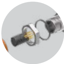
Kitted components for efficient field assembly