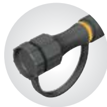
Dust caps available