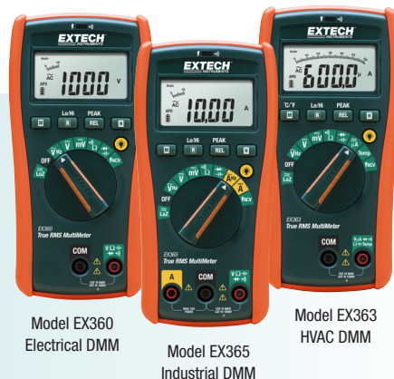
Model EX360 Electrical DMM

True RMS provides accurate readings when measuring distorted or noisy waveforms. Choose a model designed for Electrical, HVAC, or Industrial Applications. Advanced LoZ feature eliminates false readings caused by ghost voltages. CAT IV safety rating ensures the highest level of protection.