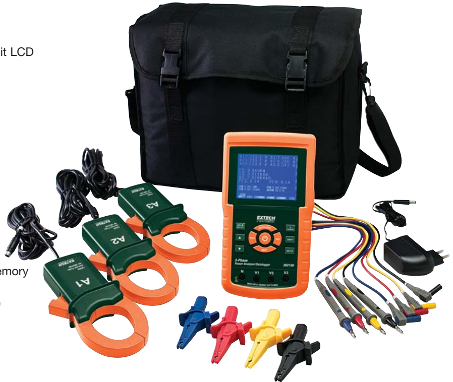
Complete with 3 current clamps, 4 voltage leads with alligator clips, 8 AA batteries, SD memory card, Universal AC adaptor (100 to 240V), and case