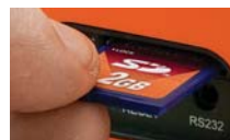
SD memory card included