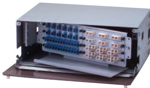
AX100115 FiberExpress (4U) Rack Mount Patch Panel