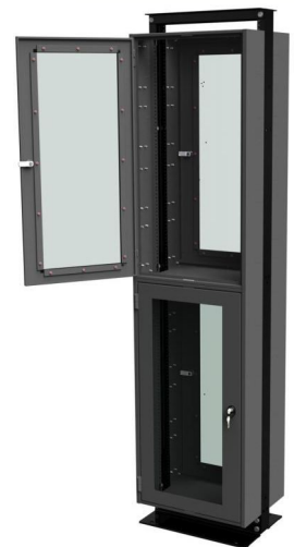
Front & Rear 44U SecurePatch Kit Consisting of (4) 22U Units connected via BSP-CBRKT.

Install on the Front & Rear to enclose a portion or the whole rack!