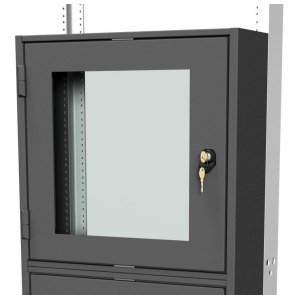
11U 6" Deep

Multiple side knock-out options allow for low or high capacity cable feed through options!