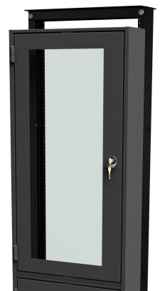
22U 6" Deep

Install on the Front & Rear to enclose a portion or the whole rack!