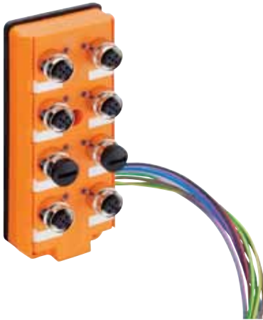
ASB 8/LED 5-4/1.5M