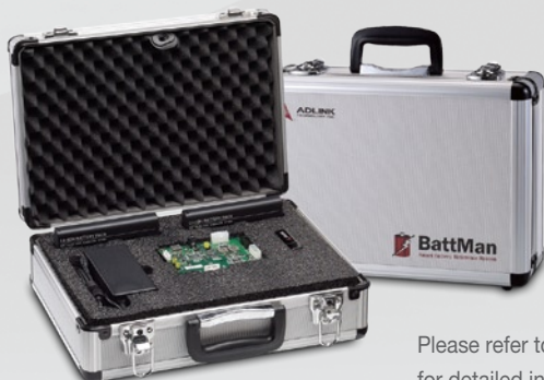
BattMan Smart Battery Management Reference System

Please refer to page 1-45 for detailed information