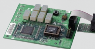
LPC POST Debug Board

Please refer to page 1-46 for detailed information