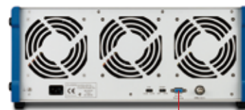
Remote Monitoring Port

The PXIS-2719A has a built-in control board monitors and manages chassis status, including internal temperature, fan speed, and voltages. Using the RS-232 monitoring port, the chassis status information can be exported to another computer for remote management. The control board can also accept commands from the remote system to allow remote power on/off and fan speed control of the PXIS-2719A chassis.