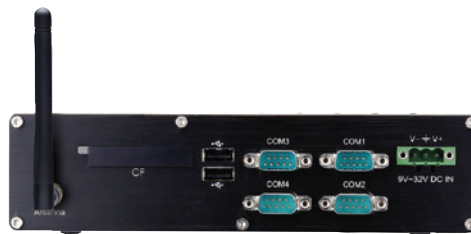
MXE-3000 with Antenna