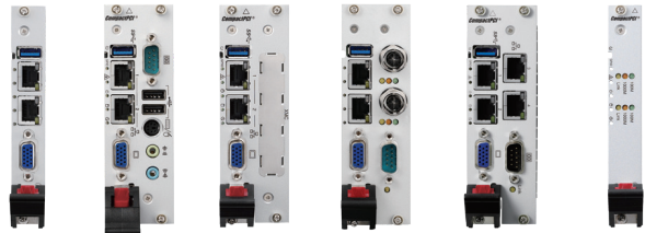
cPCI-3620 cPCI-3620D cPCI-3620S cPCI-3620T cPCI-3620TR cPCI-3620N