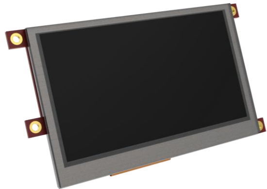
The uLCD-43-PT Display Module