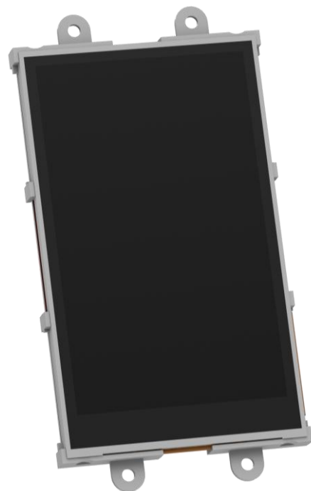
The uLCD-32W-PTU Display Module