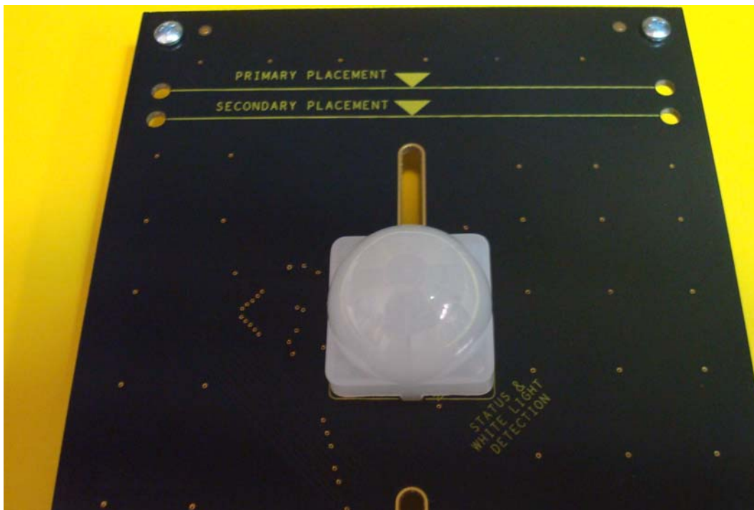
Figure 2. Assembled Clip-In Lens Installed on the ZMOTION 20-Pin Detection and Control Development Board

This clip-in lens style clips directly into the circuit board over the top of the PIR sensor. There are 4 mounting clips on the lens that are aligned with the slots in the circuit board. Note the locating tab on the side of the lens is to be aligned with the silkscreened tab, as indicated in Figure 2.