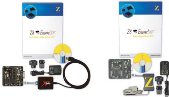
20, 28-Pin Development Kit