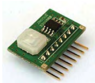
Right-Angle connector version shown (ZEPIROAAS02MODG)

Straight connector version also available (ZEPIROABS02MODG)