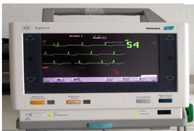
Medical Hand-Held & Stationary Systems