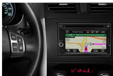
Automotive Infotainment & Vehicle Navigation Unit