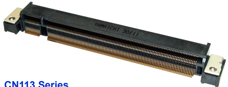
CN113 Series Infotainment Module Connector