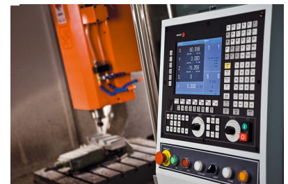
Industrial & Ruggedized Computers