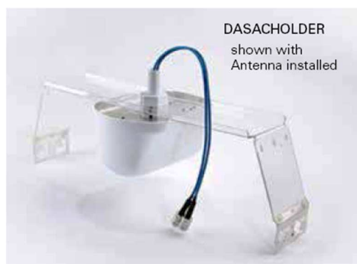
DASACHOLDER shown with Antenna installed