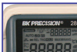
Back Lit LCD (2890A only)