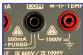
IEC Rated Inputs