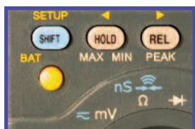
Easy to Understand Interface