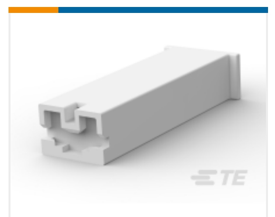
TE Part #928083-1 PL 187 REC HSG 1P NYLON NAT