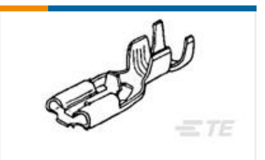
TE Part #170330-2 PL 187 RECEPTACLE 24-20 AWG NPPHBZ