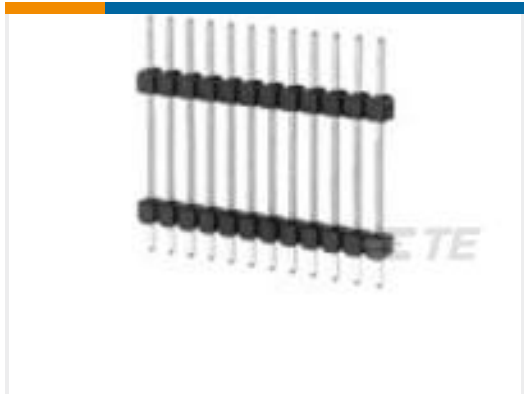
TE Part #6-146459-4 14 MODII HDR SRST UNSHRD STKG