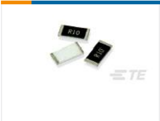
TE Part #9-1879464-9 RL73K 3A R91 5% 1K RL