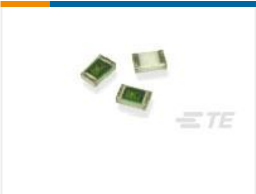
TE Part #1-1614354-6 RN 0603 549R 0.1% 10PPM CUT LENGTH