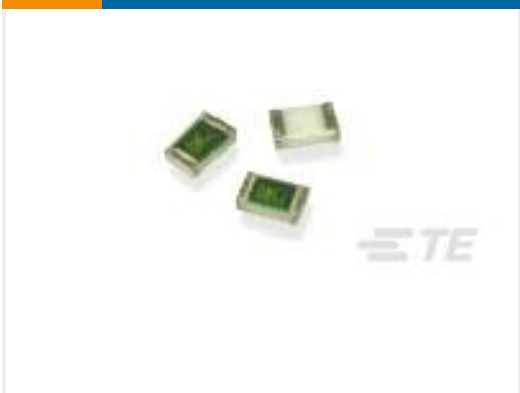
TE Part #1614379-5 RN 0805 12K 0.1% 10PPM CUT LENGTH