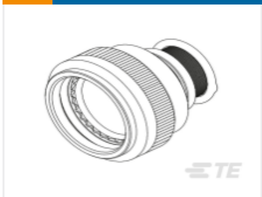
TE Part #EJ2971-000 TXR40AZ00-2016AI-RW