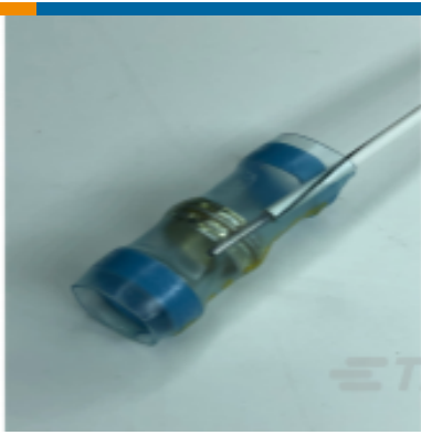
TE Part #740072N002 SO63-3-01CS2720