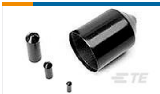
TE Part #A70118-000 101A041-100/180-0