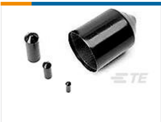
TE Part #383008-3 SSC-3/239