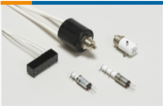
High Voltage Relays(38)