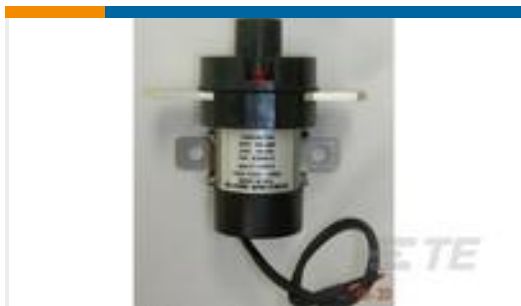
TE Part #2-1616980-5 K200A1C1=CONTACTOR 200 AMP SPST 28 VDC