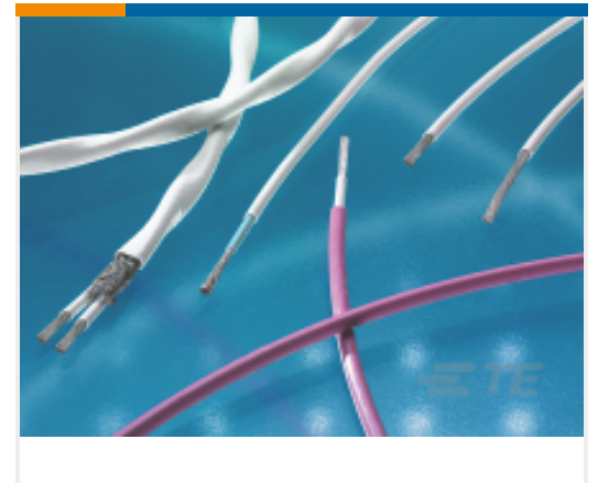
TE Part #EF6026-000