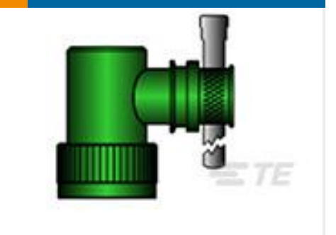
TE Part #CW3825-000 R85049/90-17W03