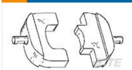
TE Part #46757-2 DIE AMPPOWER 69082 700MCM