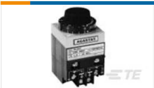
TE Part #7-1423159-5 7012SJSX=RLY,STD,ON,2P, 250VDC