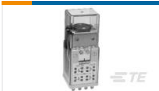
TE Part #1-1423155-5 GPFN=RLY,GEN,PURP, 250VDC