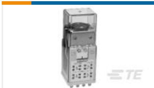
TE Part #1423155-4 GPCN=RELAY, 48VDC W /BLOWOUT DE