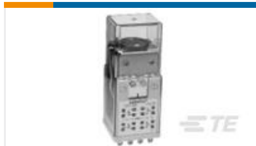
TE Part #1-1423155-4 GPF=RELAY, 250VDC