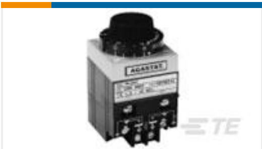
TE Part #3-1423159-8 7012PJX=RLY,STD,ON,2P, 125VDC,