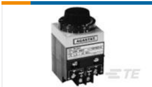
TE Part #4-1423159-3 7012PKX=RLY,STD,ON,2P, 125VDC,