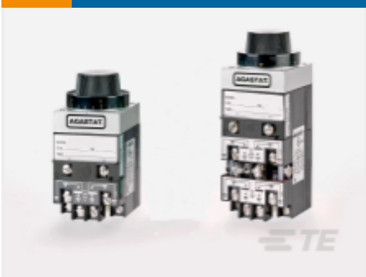
TE Part # 1423157-5 7012AC=RLY,STD,ON,2P, 120VAC,15