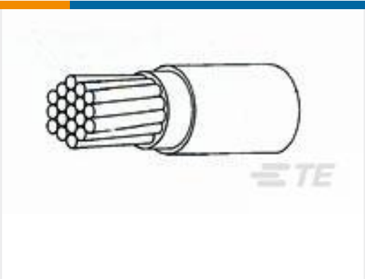
TE Part #2825653001 44A0211-16-5