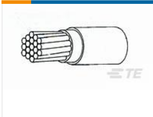
TE Part #2825043001 44A0311-16-0