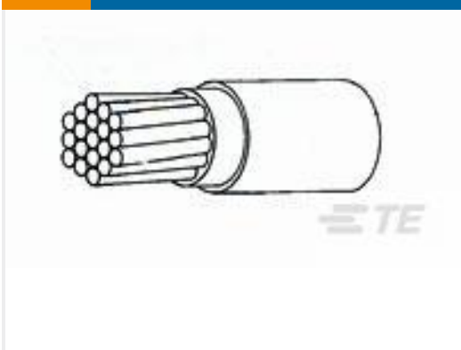
TE Part #2824113006 44A0211-16-0