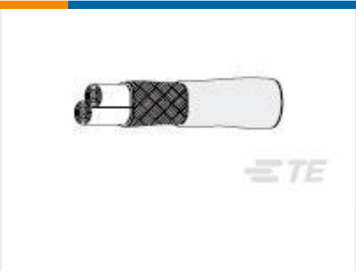
TE Part #CT77043001 44A1221-14-0/2-9