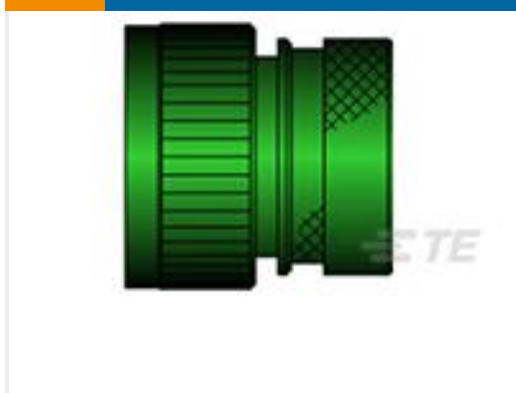
TE Part #355365-000 225M510-19C