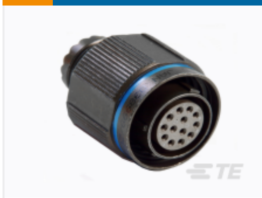
TE Part #DTS26W13-35SN PLUG ASSY