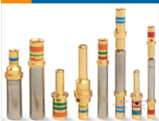
TE Part #2562-201-2031L CONT SOC ASSY