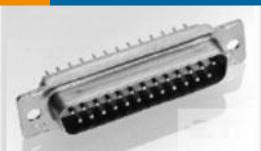
TE Part #205162-1 AMPLIMITE,ASY,PLUG, STD,109,1