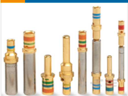
TE Part #2560-215-1631L CONT PIN