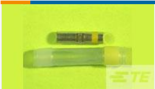
TE Part #6500760004 D-436-38CS454