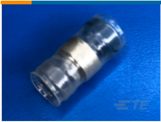
TE Part #280384-000 D-142-65CS2829