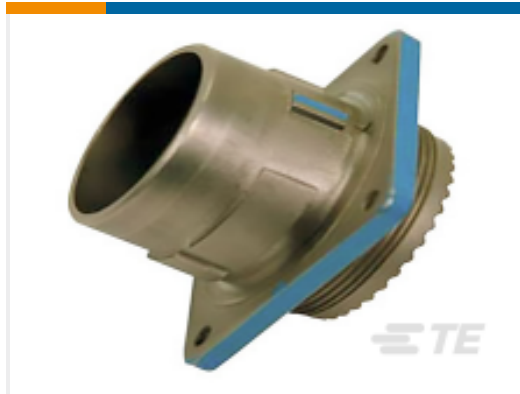
TE Part # ZPF000000000141058 D38999/46WF35BN