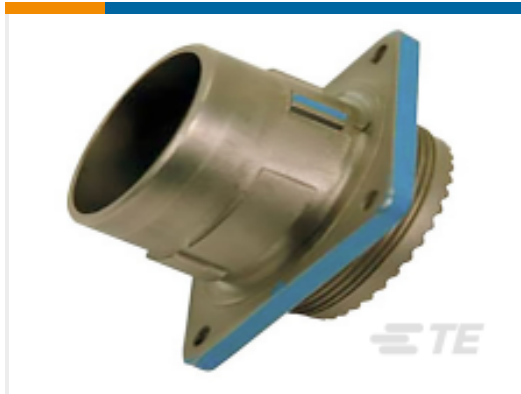
TE Part # ZPF000000000140715 D38999/46WF35BA