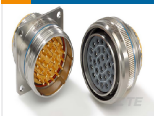
TE Part # ZPF100000000008565 983-6S 10-06 S8 L