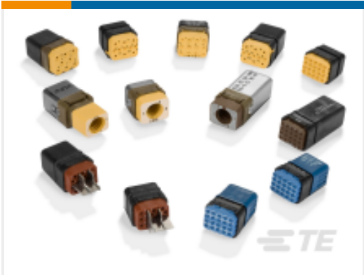
TE Part # ZPF000000000114459 DMC-M 22-10 BA