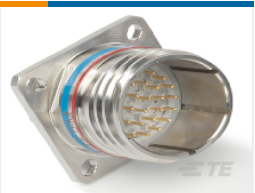
TE Part #DTS20W15-35SN RECP ASSY