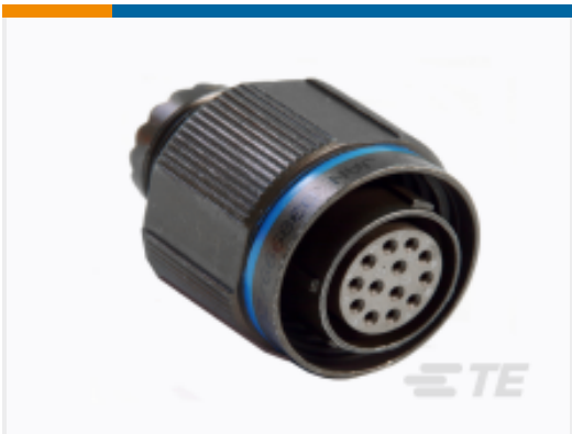
TE Part #DTS26F09-98SN PLUG ASSY