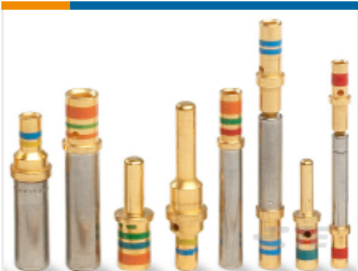
TE Part #12333-20 CONT SOC ASSY