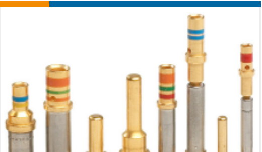
TE Part #12331-22 CONT PIN (182-0441-22)